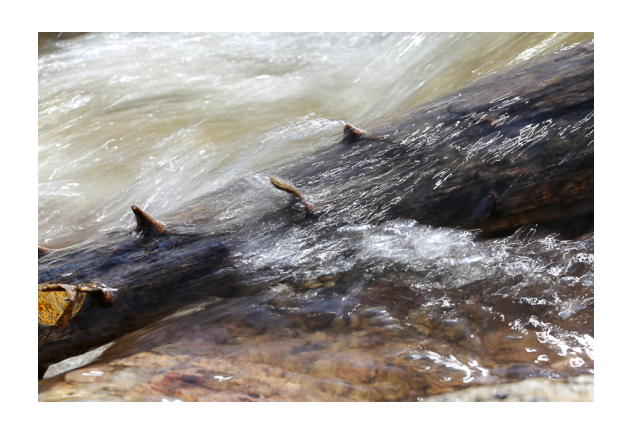
Page 8 of 10