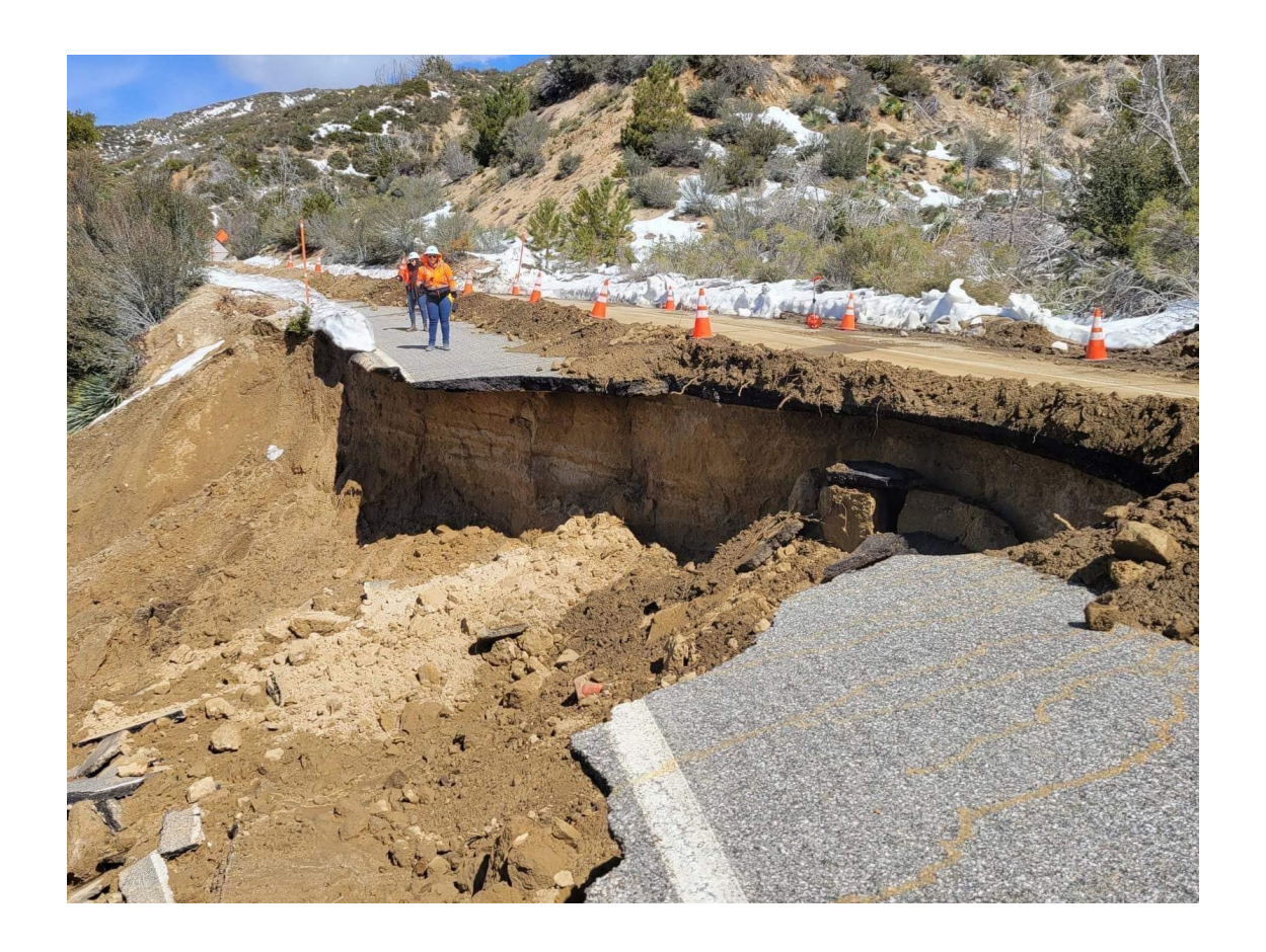
Image by Nicole Okarma Shaw, March 2023. Angeles Crest Highway in Mile 46. We watched the portion these people are standing on collapse as we drove by a few days later.

Caltrans is working to repair this washout in mile 46, and a number of areas between mile 38 and mile 42. The Angeles Crest Highway remains closed as of May 2023 beyond Red Box/Mount Wilson Road.