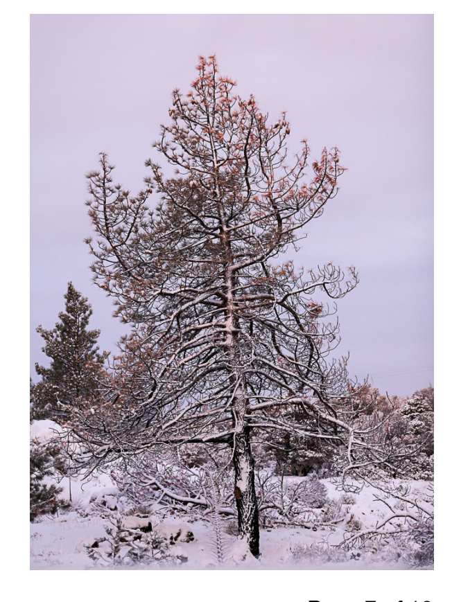
Page 7 of 10